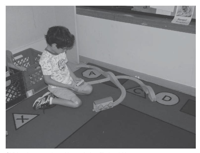
Children learn words and letters in fun-filled activities

Teachers in-the-know fill their classrooms with songs about letters, dances about words, clapping games about syllables, easel painting of names, finding the